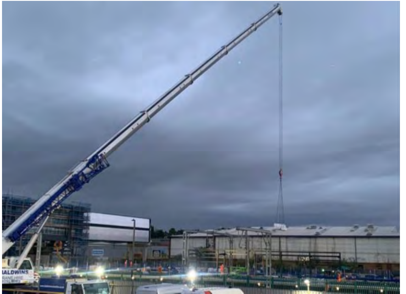
Steel lifts for the platform waiting rooms