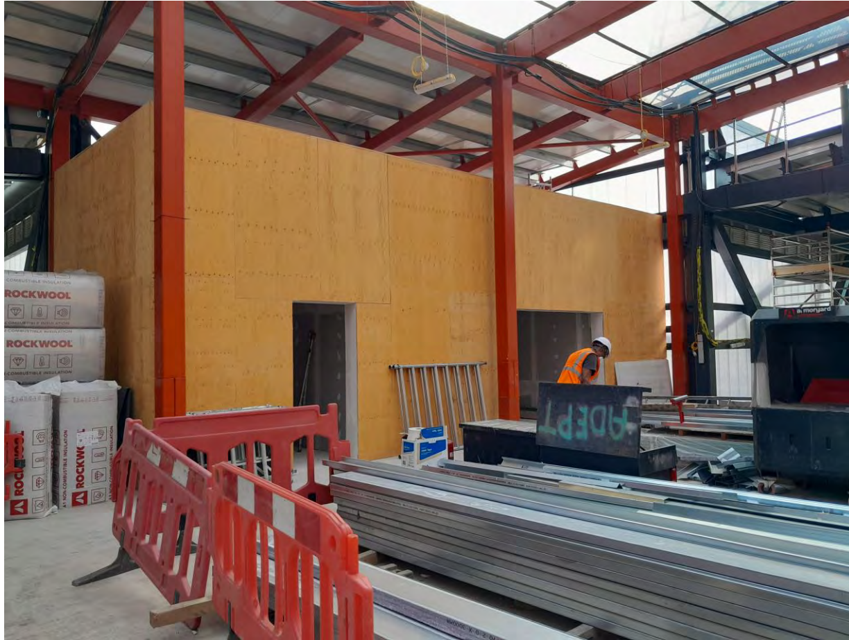
Managers room east side un-paid concourse.