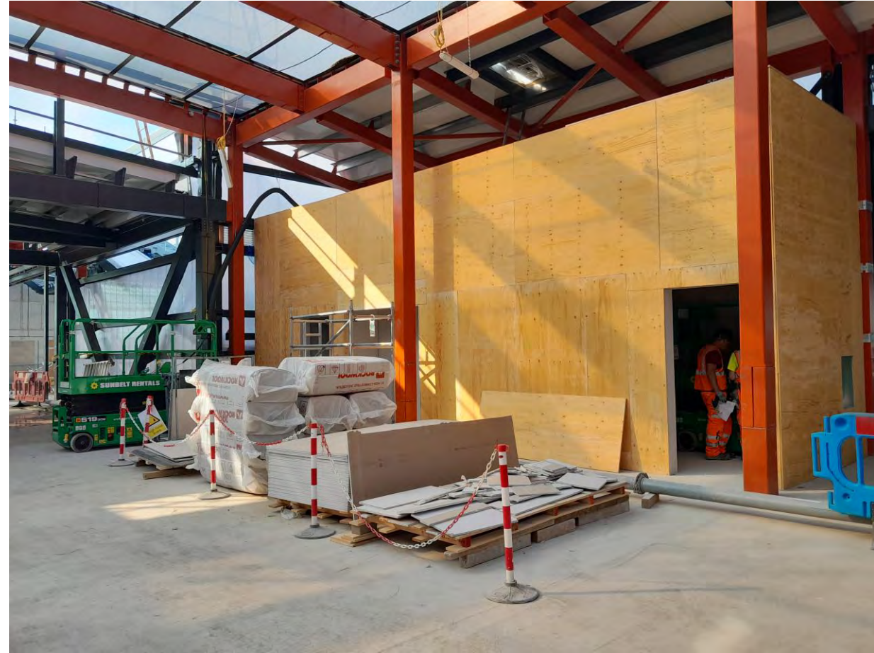
Managers room west side un-paid concourse.