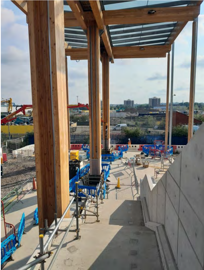
SEEB looking towards the Brent Cross Town Development