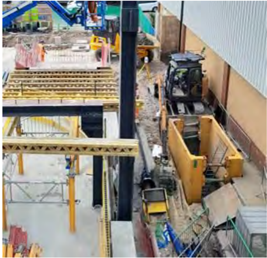
Service corridor Progression on the Western Entrance