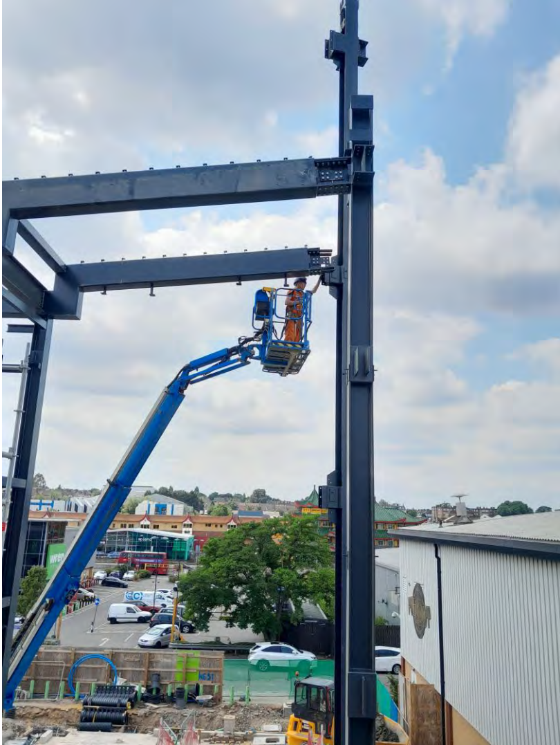
Steel work installation on the Western Entrance